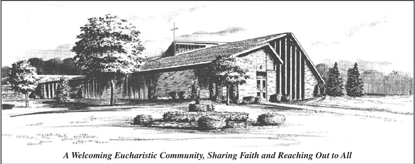
A Welcoming Eucharistic Community, Sharing Faith and Reaching Out to All

511 CHEAPSIDE ST., LONDON, ONTARIO N5Y 3X5 PHONE 519-433-6689 FAX 519-433-2301 E-MAIL: stmichlon@dol.ca www.stmichaels.dioceseoflondon.ca